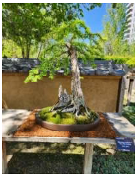
Summer display, a Pond Cypress Taxodium distichum var. imbricarium