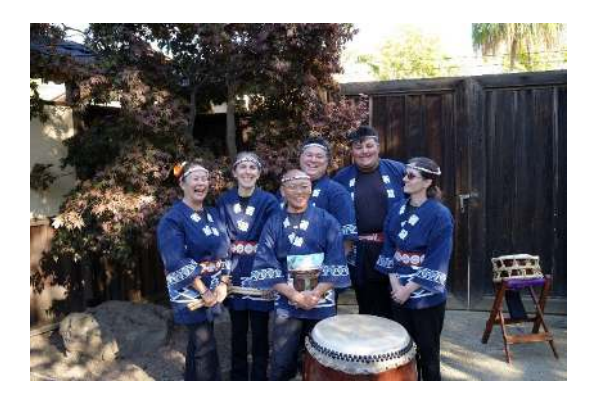
Members of the Sonoma County Taiko entertained the guests