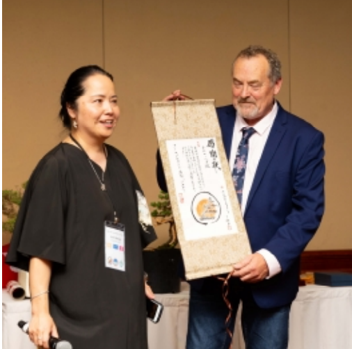
*** The photographs from the AABC 2024 Convention were provided by Patrick Hoelscher, of Pat Hoelscher Photography Studio, Brisbane Queensland.