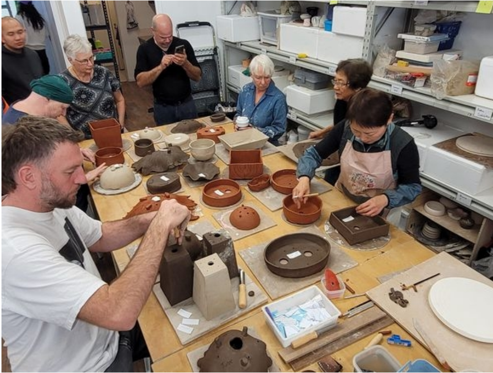
Club members at a pot making workshop